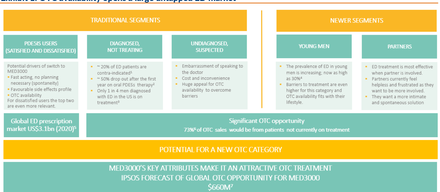
Exhibit 1: OTC availability opens a large untapped ED market